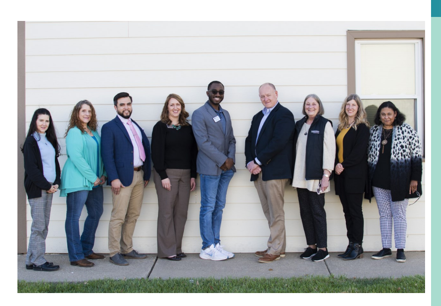
Trinity In-Home Care 2022 Board of Directors